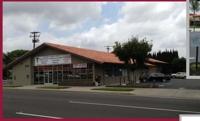
Facing Beach Blvd